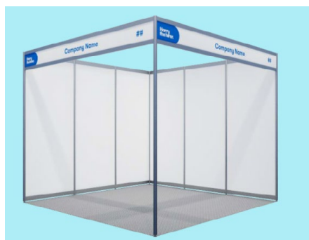
*image shows a corner stand with two open sides